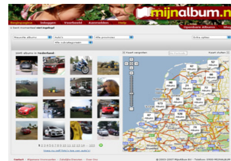
3. Target on country, state and city

Promote your website targeted on males or females.