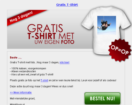
4. Standalone mail

Reach 400.000 MijnAlbum users with a standalone mail (illustration 4). The standalone mail and its title are completely dedicated to your message. The mail is being designed in the MijnAlbum layout which is familiar to our users.